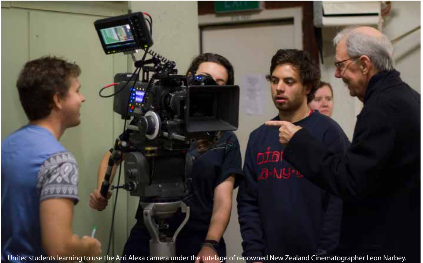
Unitec students learning to use the Arri Alexa camera under the tutelage of renowned New Zealand Cinematographer Leon Narbey.