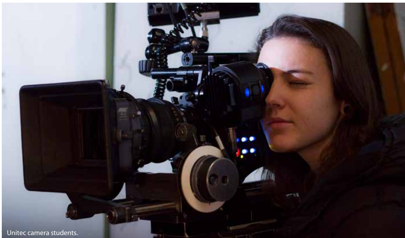
Unitec camera students.