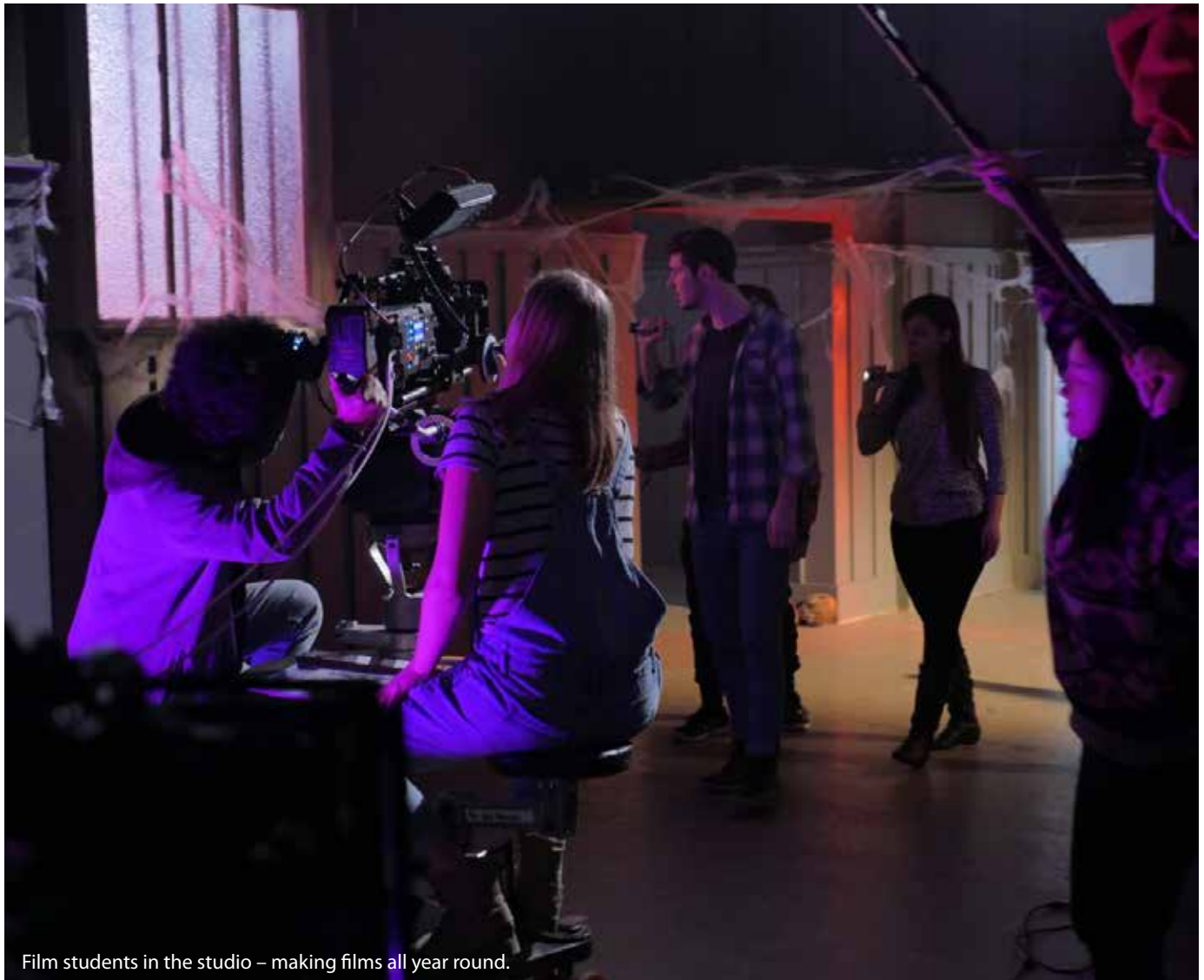
Film students in the studio – making films all year round.

projects. Develop the skills you need to start a career in the film and television industry. Build a broad understanding of the industrial filmmaking process and become equipped with specialised skills.